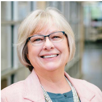
State Senator Rosemary Bayer